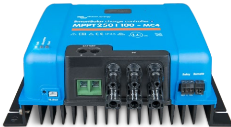
SmartSolar Charge Controller MPPT 150/100-MC4 without display