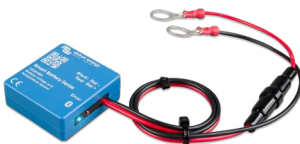
Bluetooth sensing: Smart Battery Sense