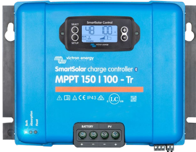
SmartSolar Charge Controller MPPT 150/100-Tr with optional pluggable display