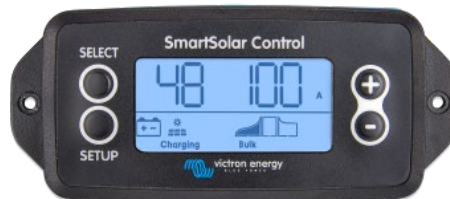
SmartSolar pluggable display

Simply remove the rubber seal that protects the plug on the front of the controller, and plug-in the display.