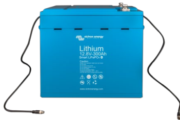
12,8V 300Ah LiFePO 4 Battery

Very useful to localize a (potential) problem, such as cell imbalance.